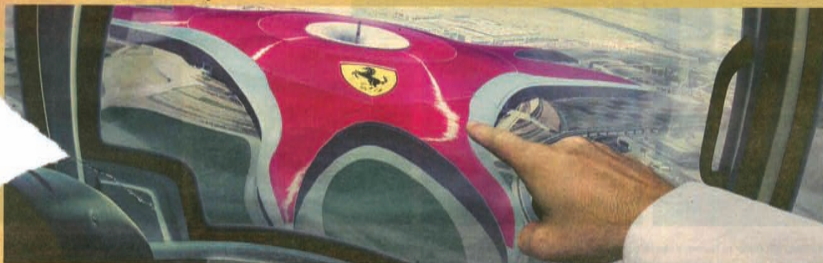
Ferrari World Abu Dhabi