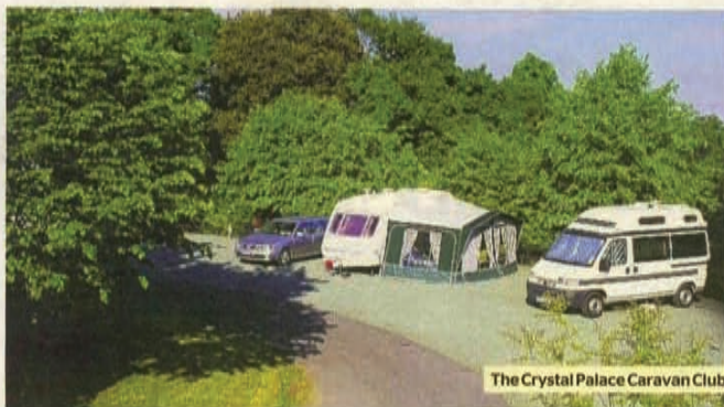
The Crystal Palace Caravan Club