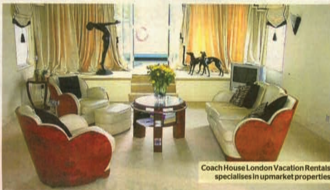
Coach House London Vacation Rentals specialises in upmarket properties

(welcomeassured.co.uk), which specialises in finding places in homes with carefully selected host families.